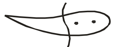
Bruce 'Skinner' Chitwood